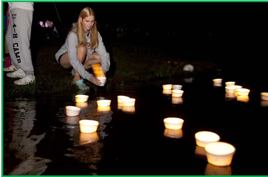
4-H Camp Wishing Ceremony.