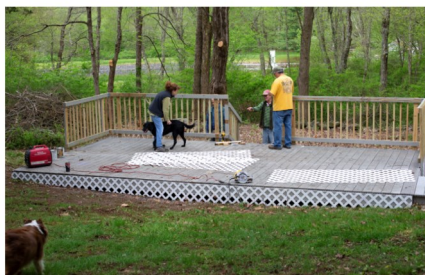
New Amphitheater in the Cedar Grove

In 1906 Knapp initiated the county-agent plan, and he organized boys' cotton and corn growing clubs to promote his agricultural ideas. In 1910 a girls corn and poultry clubs were introduced, becoming the forerunners of modern 4-H Clubs.